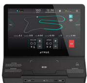
UNITE 16" TOUCHSCREEN