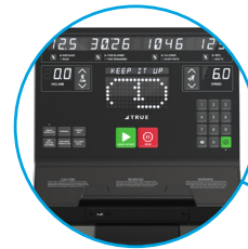
Multiple console options