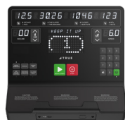
UNITE LED CONSOLE