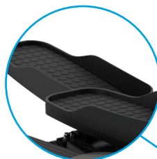
Soft Step Cushioned Anti-Fatigue Footpads