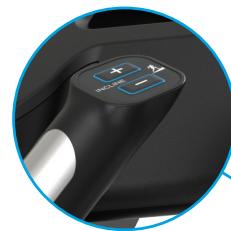
Easy-access quick-touch keys