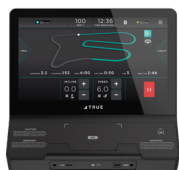
UNITE 16" TOUCHSCREEN