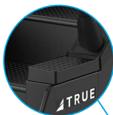
rear steps provide user-friendly step-up assistance