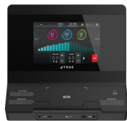
UNITE 10" TOUCHSCREEN