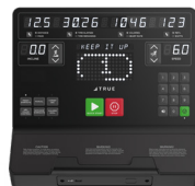
UNITE LED LED CONSOLE