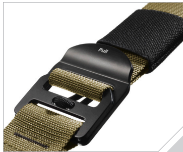
Ultra light D-ring adjustment