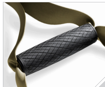
Ergonomically-designed, textured rubber handles for greater grip and durability