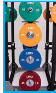
PLATE STORAGE (Optional) 8 posts for Olympic and Bumper plates with integrated storage pegs for resistance bands and chains