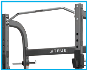
Chrome-plated, knurled, multi-position chin up bar