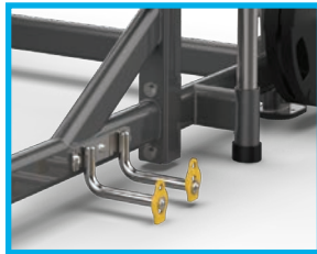
Available with optional band pegs