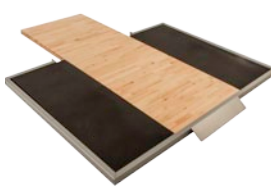
Optional Power Clean Platform Available